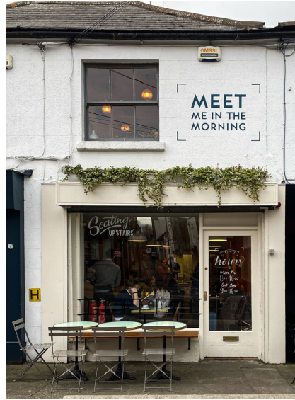
50 Pleasants Street