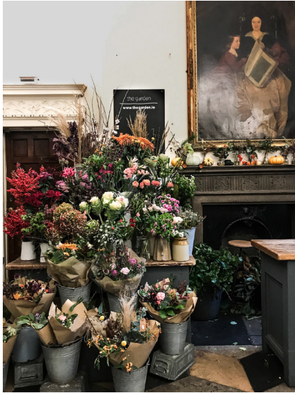
59 South William Street